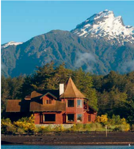
5. PETROHUE LODGE 6. ANCUUD PENGUIN COLONY